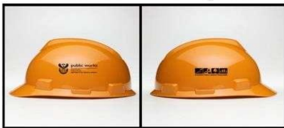
Hard Hats may be printed monochrome or colour. The EPWP and Implementing Agent Logos are to be located on the sides of the Hard Hat.