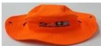
Figure 3: Hat are to have the EPWP Logo on the front of the hat. The implementing agency logo may be placed on the rear of the hat.